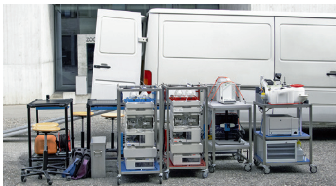
The mobile HPLC laboratory departs for the dance floor

Besides the personal drug counseling, the twelve campaigns per year allow the illegal market to be tracked. The emergence of new compounds or changing trends of consum-