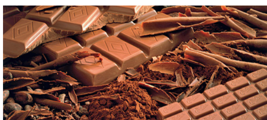
The world of chocolate.