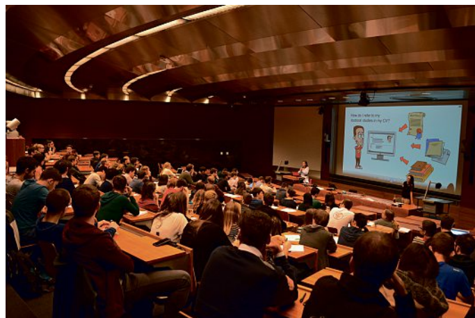
ETH Career Center CV Training: How to write a successful CV.