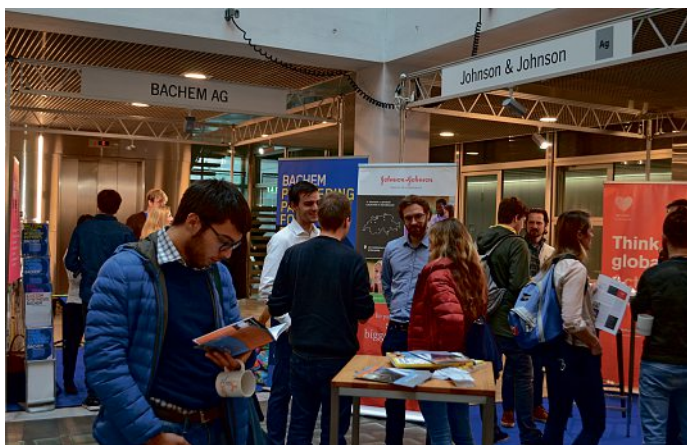
Chemtogether 2017: Over 500 people, mainly students, visited the fair.