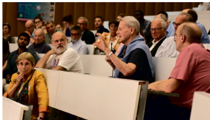
Lively discussions and real chemistry.