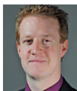
Johannes Stadler Renato Zenobi, ETH Zurich 'Full Spectroscopic Mapping by Tip-Enhanced Raman Scattering in a Gap-Mode Configuration' Near-Field Optics Conference 2010, Beijing China