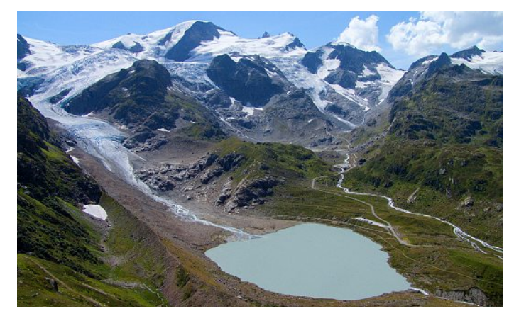
Stein glacier and Lake Stein in the Bernese Alps.

Industrial chemicals such as polychlorinated biphenyls (PCB) and dichlorodiphenyltrichloroethane (DDT) have been produced and used in large quantities more than 50 years ago. During the phase of application they were released to the environment and mainly distributed by atmospheric transport. Today, due to their hazardous properties these chemicals are apostrophized as persistent organic pollutants (POPs) and are banned worldwide by the Stockholm Convention. However, they are still circulating in the environment. Actual and historical atmospheric input of chemicals can be calculated from investigations of dated lake sediments. Trace analyses of POPs in sediments from Swiss plateau lakes using gas chromatography-high resolution mass spectrometry show decreasing input in the last 40 years. In strong contrast, we observed increasing input in proglacial lakes. This surprising phenomenon led us to the 'glacier hypothesis' claiming that POPs deposited in the past on glaciers are now released from the melting ice. This hypothesis has been corroborated by findings from sediment analyses of several mountain lakes. In these investigations we observed that not only the long-term behavior of glacier movement and ablation but also short-term based growth and decline are reflected in the sediment input of a proglacial lake.