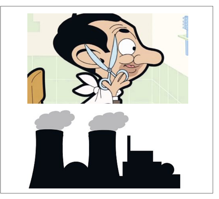
Radioactive fallout, which is incorporated with food and via air, is deposited in human hair to some extent.