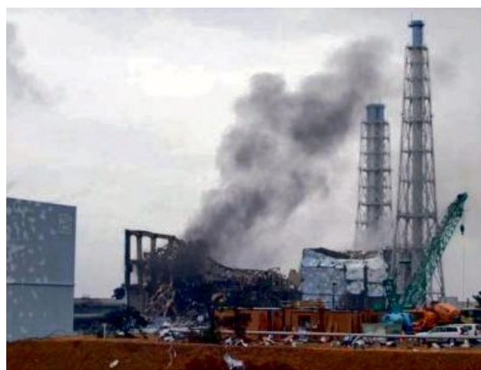
Nuclear power plant Fukushima-Daiji after the accident

We extract the ^{90}\text{Sr} directly from the water sample with an organic solvent. It contains the crown ether dicyclohexano-18-crown-6 as an extracting agent and didodecyl-naphthalene sulfonic acid as a scintillator. It is commercially available as STRONEX. 8 mL of this extracting solvent are sufficient to extract more than 70% of radiostrontium from a 1L water sample. Interfering \beta -nuclides (such as ^{140}\text{Ba} ) are eliminated by a scavenge with barium chromate prior to the extraction. Three hours after sampling, the first ^{90}\text{Sr} results are available. Twenty samples can be analyzed within 24 hours when using one liquid