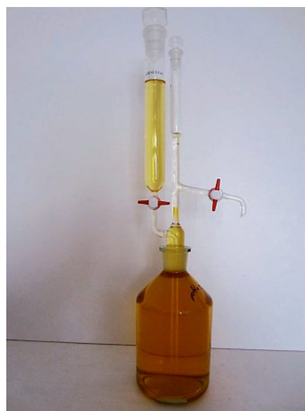
Microseparator system for the separation of the upper STRONEX phase from the water sample (yellow). The STRONEX is drained with the valve to the right.

W. McDowell, 'Proposed separation and analysis scheme for strontium', ETRAC Inc., 1995 , www.ordela.com .