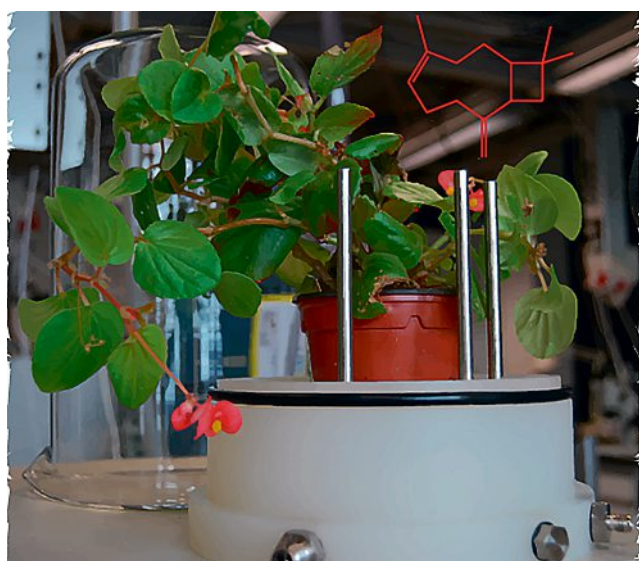
Begonia semperflorens within the container used to study its chemical emissions. During daylight it produces caryophyllene, among hundreds of other molecules.