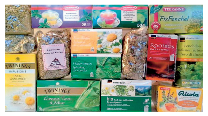
Samples of selected teas and herbal teas from the Swiss market.