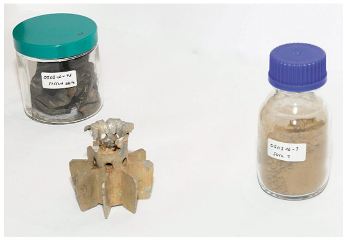
Samples suspected of contamination with sulfur mustard.

^1\text{H} NMR is a powerful spectroscopic method for the identification of chemicals. The application of ^1\text{H} NMR to the analysis of environmental samples is in most cases not limited by its sensitivity but by the signals from the background chemicals present in the sample which partially or completely obscure the analyte signals. This necessitates a sample preparation step to isolate the analytes from the background chemicals. In the