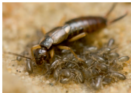
An earwig mother tending her clutch of 1st instar nymphs.

European earwig ( Forficula auricularia ; Dermaptera) mothers care for their nymphs by defending them against predators and providing food via individual mouth to mouth food regurgitation. Chemical extract from CHCs of nymphs reared under different nutritional conditions (high-food versus low-food) were