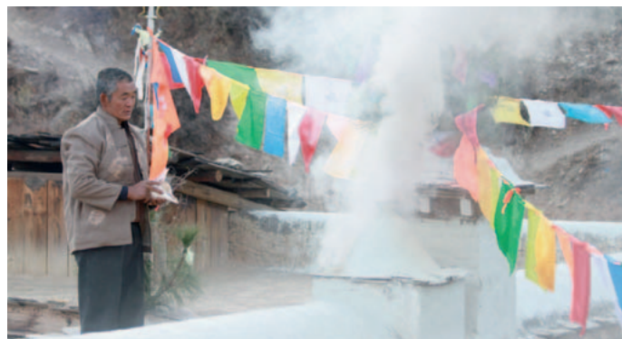
Tibetan man worshipping the mountain gods. He burns incense plants in a ritual burner on the flat roof of the house.

In Southwest China, especially in the Tibetan cultural area, the use of ritual and incense plants is very common. Incense plants are burned freshly or dried and are used to communicate with deities and spirits of the surroundings but also for the treatment of diseases such as respiratory ailments. Our research focuses on a comparative analysis of ritual plants used among different ethnic groups in this area. Since we are especially interested in the continuum between ritual and medicinal use of incense plants and aim to understand the rationale for their use as medicine, we look at the cultural context of plant use, but also analyze the volatile organic compounds (VOCs) of the smoke. So far we documented some 40 ritual plants. Foremost among the incense plants are Juniperus , Cupressus , and Rhododendron species. Important characteristics of incense plants are the density,