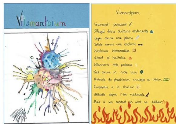
Fig. 3. Imaginary element and acrostic poem of the winning class.

It is worth to note here that, following the example of the illustration above, many classes of all levels created imaginary elements, which were modeled according to the physicist’s point of view or to the Bohr’s model of the atoms, i.e. with electrons gravitating around the nucleus like planets around their star. This points out that chemists still have a lot of work to do in order to popularize amongst the young audiences the concept of electron orbitals.