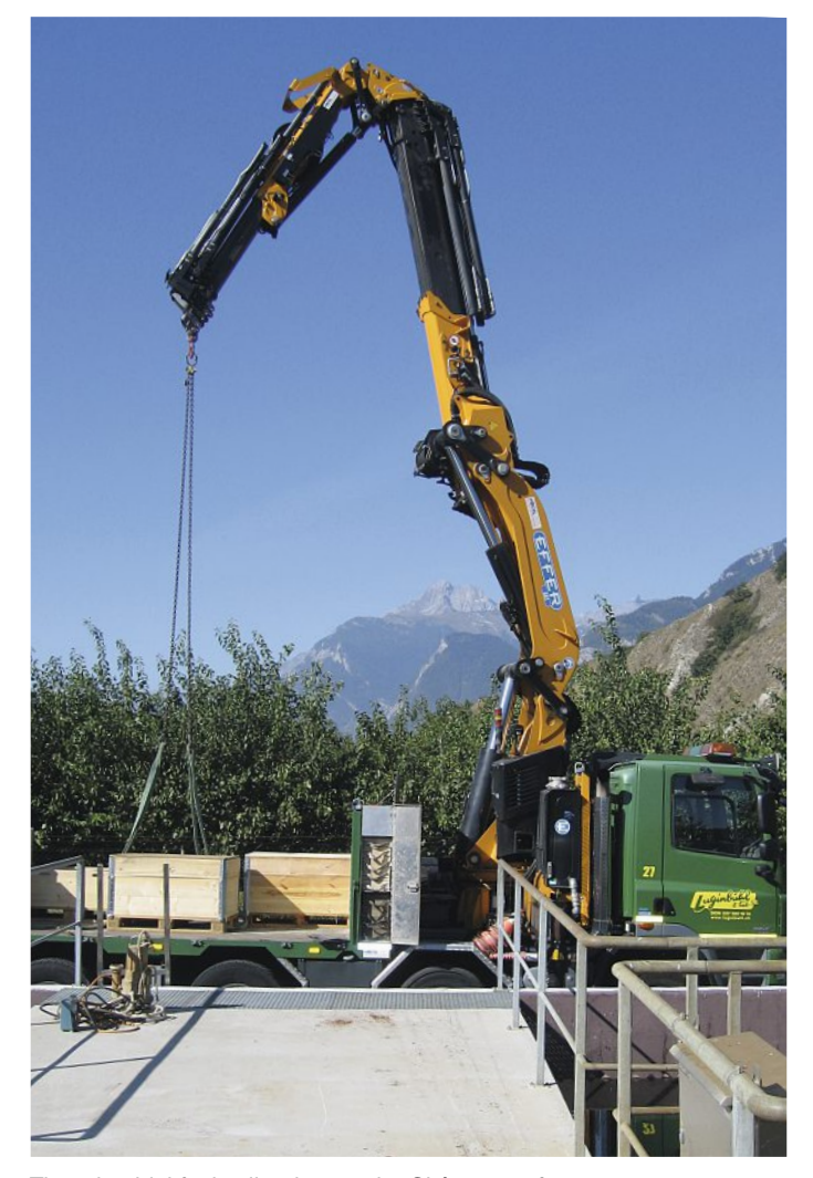
The microbial fuel cell arrives at the Châteauneuf wastewater treatment plant in Sion.

It takes 7.5 Watts to purify the sewage produced by one person. Processing this water in a microbial fuel cell would save 50–70% of this energy. Consequently, it will only take 2.3 Watts of electricity per inhabitant to operate the bioelectrochemical sewage treatment plants of the future. The electricity generated by the process should further reduce the amount of electricity required. As a result, 20 Watts remains for conversion into bioelectricity. If half of this energy were converted into electricity, it would be possible to save 10 Watts per inhabitant. Given a price of 20 centimes per kWh, a sewage treatment plant for 100,000