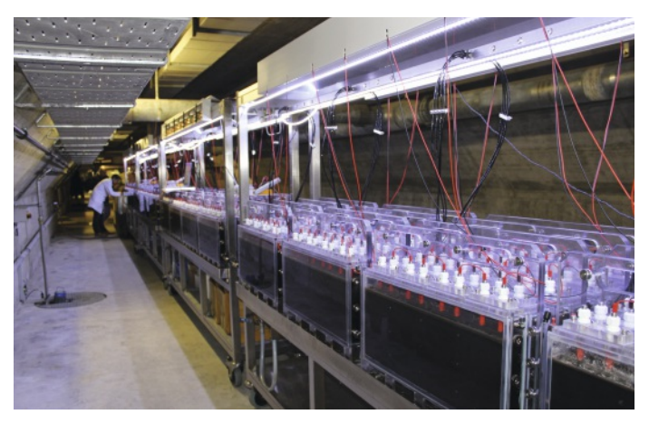
64-unit microbial fuel cell block for treating wastewater and generating electricity.

Microbial fuel cells also work with other waste. Using the fifty percent of food production that is thrown away would increase output per person from 10 to 60 Watts. In this case, and again omitting any power that the purification plant might consume, annual income rises to up to 10.5 million francs. All in all, large-scale microbial fuel cells represent a promising way of reducing the cost of operating wastewater treatment facilities.