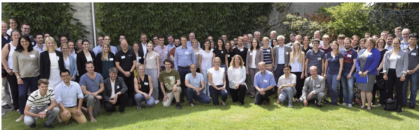
Fig. 1. The 10 th Wädenswil Day of Life Sciences attracted guests from industry and academia.