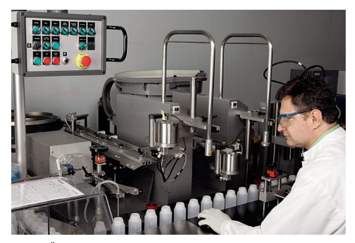
Today BÜHLMANN Laboratories is the leading 'calprotectin company', supplying the widest range of calprotectin assays for fully automated laboratory applications and a unique rapid quantitative test called 'Quantum Blue<sup>®</sup>'.

BÜHLMANN Laboratories Ltd in Schönenbuch, whose innovative test methods regularly set new standards, is also involved in point-of-care (PoC) tests. One example is the Quantum Blue® Calprotectin rapid quantitative calprotectin test, the only one of its kind in the world, for the management of IBD patients. Large quantities of the protein calprotectin occur in the neutrophils (inflammatory cells) of people with inflammatory disorders. The neutrophils travel to the site of the inflammation, where they secrete calprotectin into the surrounding tissue. This fact helps doctors to differentiate between irritable bowel syndrome (IBS, negative for calprotectin) and inflammatory disorders (IBD, irritable bowel disease, positive for calprotectin) such as Crohn's disease and ulcerative colitis when examining the patient's stools. Millions of people worldwide suffer from these symptoms, and there is certainly a need for a rapid and efficient test that avoids the need for unnecessary diagnostic endoscopic procedures and colonoscopies. Moreover, the treatment of patients who test positive for IBD can be monitored by regularly measuring the level of calprotectin in their stools. The Quantum Blue® Calprotectin Assay is based on a simple, established lateral flow technology which, with the aid of a user-friendly reading device, produces quantitative results for calprotectin within 12-15 minutes, a speed comparable to the ELISA reference test.