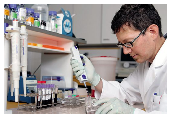
IBDoc<sup>™</sup> is a user-friendly tool that allows patients to perform a calprotectin stool test in the comfort of their own homes. It is scheduled for market launch by the end of 2014.

Muttenz and forteq Ltd. in Nidau, a specialist in highly complex precision polymer components, to develop the CALEX® device. "It's an extremely sophisticated 'plastic tube' filled with a buffer solution," explains Dr. Jakob Weber, Corporate Scientific Officer. "It helps prospective patients take a small amount of stool rapidly and hygienically. The same tube is then used to homogenize the sample and apply an accurately metered drop of the resulting mixture to a calprotectin test cassette. The treated test cassette is managed using an app and measured using a smartphone camera. In just a few seconds, the result appears on the screen in the form of a traffic light (normal, moderate, high). It is then sent by internet to the requesting doctor, who saves it in a web-based patient dossier. This IBDoc<sup>TM</sup> system generated a lot of interest among healthcare professionals at the ECCO (European Crohn's and Colitis Organisation) fair in Copenhagen in February 2014 and is scheduled for what is expected to be a very successful commercial launch in the middle of this year.