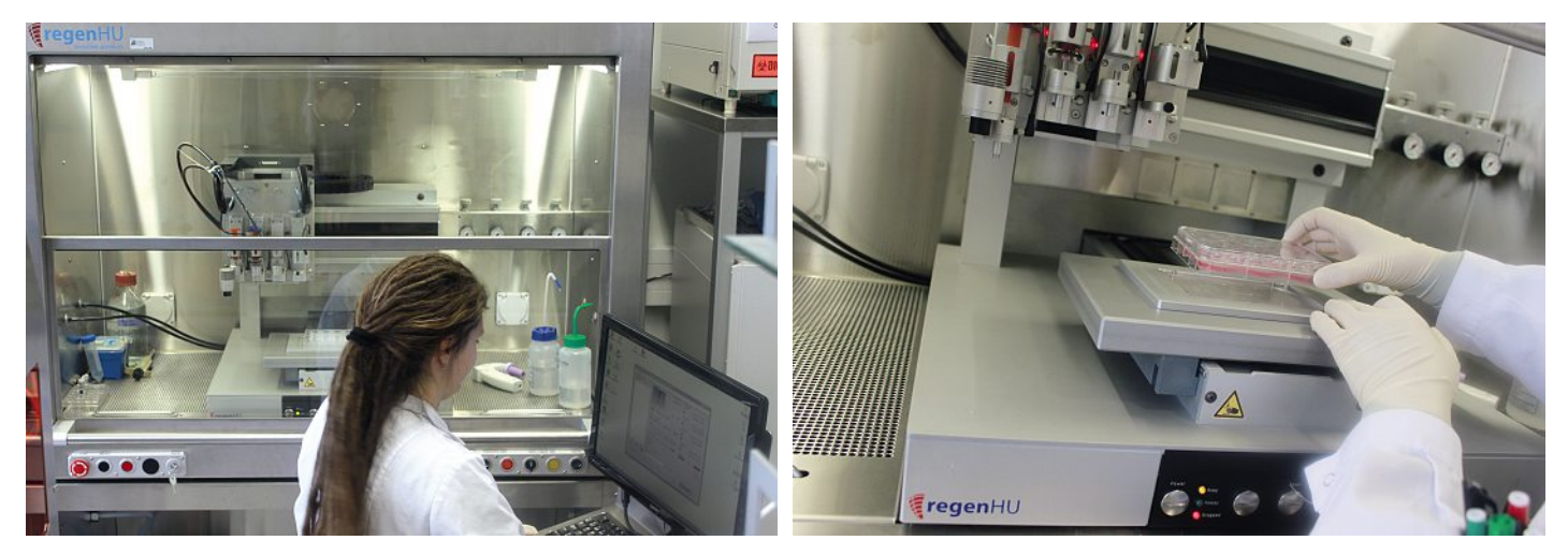
3D bioprinting of skin models: Layer-by-layer production of skin enables dermis and epidermis to be created rapidly and precisely, with an OCT camera ensuring in situ quality control.