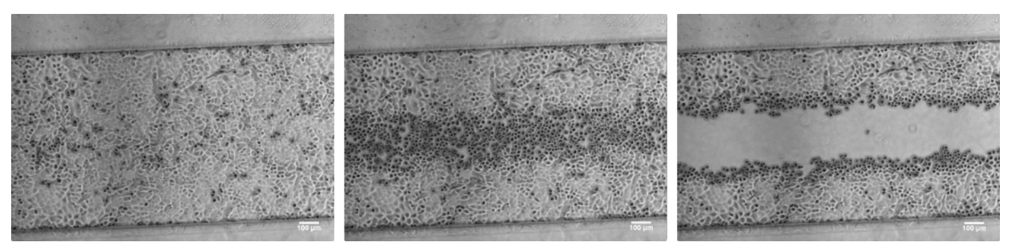
Creation of an alveolar microlesion using hydrodynamic focusing in a microplatform. Time-lapse images of the alveolar epithelial cells before, during and after experimental injury.

The TEDD management team is currently preparing for the international 3D cell culture symposium that is due to take place in Freiburg im Breisgau from June 24–27, 2014. TEDD is represented on the Scientific Board and is organizing the workshop on Advanced in vitro liver models for toxicological profiling .<sup>[2]</sup> In addition, the TEDD Annual Meeting will be taking place in Wädenswil on October 9, 2014. It is part of the European Biotech Week organized by the National Thematic Network NTN Swiss Biotech. In keeping with the biotechnet Switzerland