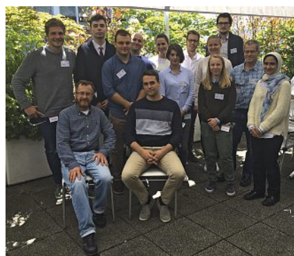
Coffee break on the terrace of the cafeteria