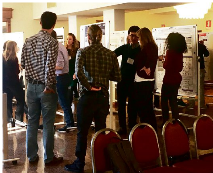
Poster sessions were an integral part of the seminar creating opportunities for networking and future collaborations.