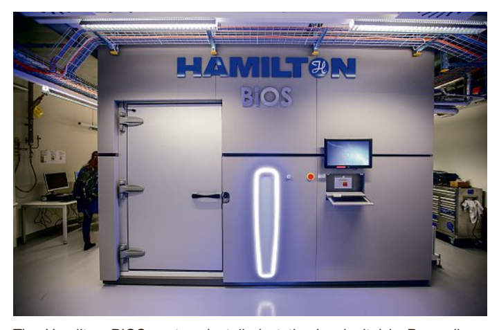
The Hamilton BIOS system installed at the Inselspital in Bern allows biological samples to be stored at -80 °C. The system fully automates the handling of the sample, including its storage, retrieval and inventory.