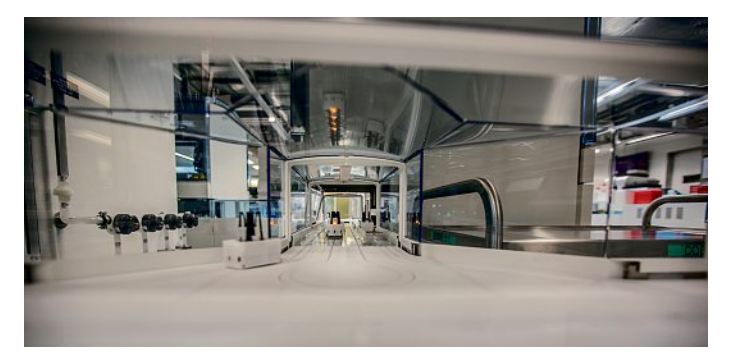
Laboratory tour of Clinical Chemistry at the Inselspital Bern during the Thematic Platform IVD event on the 25<sup>th</sup> of April 2016. Sample automation at the Inselspital in Bern. Blood samples of patients are tracked and transported, in a fully automated process, to the respective locations for analysis.

To ensure excellent scientific quality and a broad base of experience, an expert advisory board – consisting of seasoned professionals from industry and academia – monitors the activities of the steering committee of the Thematic Platform and contributes with know-how and guidance in the development and implementation of the strategy. The Thematic Platform's mission is to promote technological innovation in in vitro Diagnostics (IVD) and to enable translational research from academia to