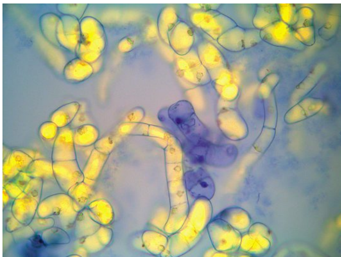
Nicotiana tabacum BY-2 suspension cells stained with Evans blue. The blue coloration indicates dead cells.

The work on current subjects such as the plant suspension cell-based IgG production, the mass propagation of terpenoid expressing hairy roots or the expansion of mesenchymal stem cells in single-use bioreactors is ideal for the self-study process.