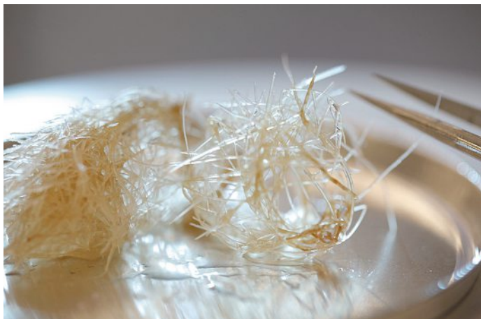
Hairy root cultures – a special tissue which exhibits superior genetic stability.