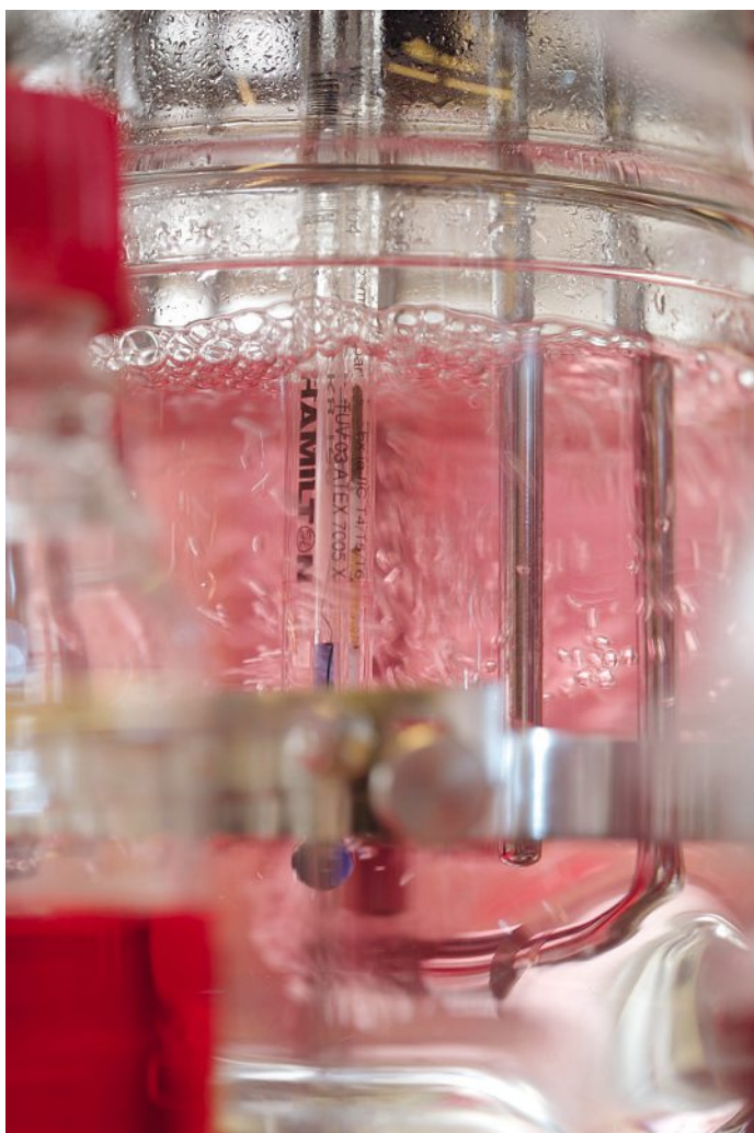
Standard stirred bioreactor at laboratory scale, prepared for the cultivation of mammalian cells, running a sterility test.