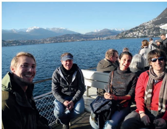
ContaSed 2015 participants on Lake Lugano.

downhill hike to the lake shore village Gandria and a boat cruise on Lake Lugano.