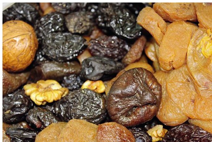
As the researchers found in their study, dried prunes, apricots, figs and walnuts – past their expiry date – serve as an excellent carbon-rich waste co-substrate for anaerobic digestion.