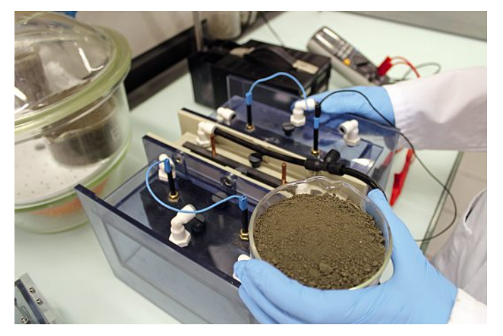
Marc Sugnaux shows de-watered and digested sewage sludge prior to phosphate extraction in the microbial fuel cell. In the middle of the reactor, the abiotic cathode for phosphate remobilization, to the left, the bio-anode in the wastewater stream for the production of bio electricity.

An important influence is exerted by the predominant pH level. This level allows a fast substitution mechanism and is particularly virulent under electrolysis conditions. Apart from the strong pH dependence, the researchers observed a temperature effect, with an acceleration of the process at a slightly elevated temperature. Fabian Fischer's group analysed the produced struvite fertilizer by inductively coupled plasma mass spectrometry (ICP-MS). The investigation confirmed that the levels of cadmium, lead and other heavy metals in recycled fertilizer could easily be kept below the legal limits.