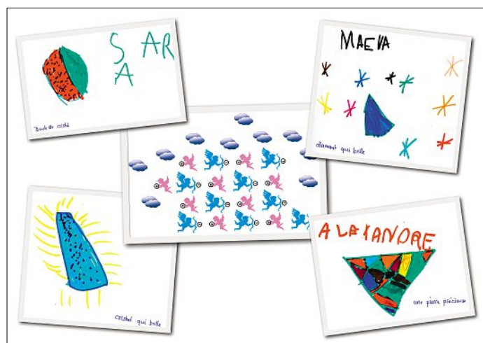
Fig. 1. Four of the drawings of crystals produced by 5-year-old participants from a class of the Primary School Vélodrome. One of the illustrations used to explain in simple terms how crystals grow from dissolved cations (pink angels) and anions (blue cupids) when water (grey clouds) slowly evaporates is shown in the centre.

During and after the crystal growth period, many positive feed-backs on the contest and fancy correspondence were sent by participants from all levels. For example, a teacher sent us a very detailed identification of the unknown salt received, using pH, solubility tests and simple chemical reactions for major ions, and even a flame emission test for cations; the teacher concluded, on the basis of her observations and the fact that the salt could favour algal growth, that the unknown salt contained potassium and phosphates, most probably a mono- or dipotassium phosphate! Several Primary level classes competed in the same school to obtain the nicest and most exotic crystal. The 26 children of a French Primary level class even sent each a handwritten letter to the committee, asking to take part in the contest. In another