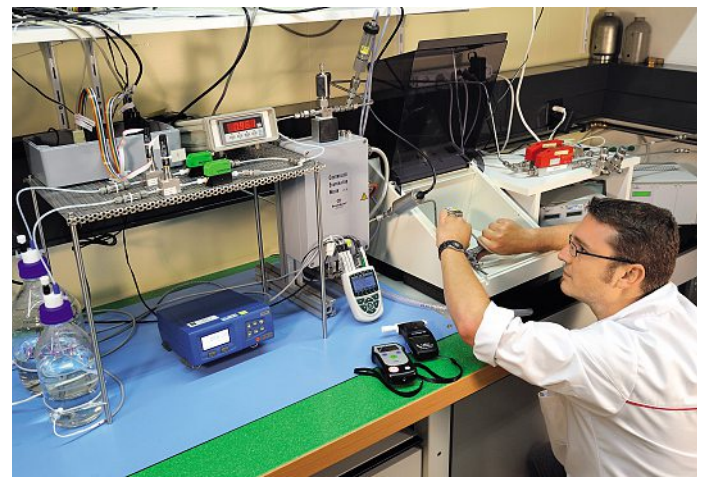
The generator for wet breath-alcohol analysis built at METAS.

desirably ensured without the OIML-convention.<sup>[1,3,4]</sup>