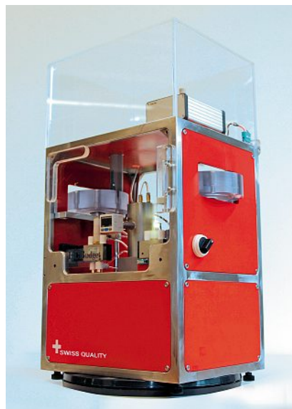
Fig. 1. Picture of the newly developed low-cost analytical capillary electrophoresis device.

This new CE device (Fig. 1) is dedicated to conventional quality control of drug material (active principal ingredient, API) and drugs products (pharmaceutical formulations). CE should be successfully implemented in routine analysis due to its short analysis