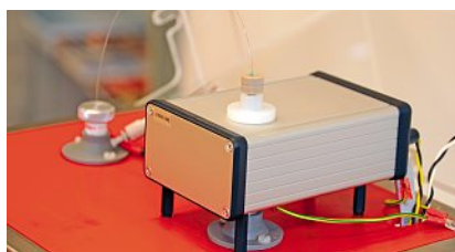
Fig. 2. Detail view of the UV detector based on LED technology.