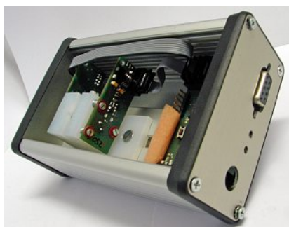
Fig. 3. Close-up of the UV detector based on LED technology.

tion devices, photosynthesis in plants, phototherapy, UV curing, etc.). Recently, the wavelengths attained with LEDs reached 250 nm, and so opens up new possibilities in detection systems for HPLC [3] and capillary electrophoresis. [4–7]