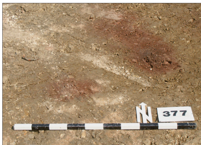
Red-brownish colorations in the floor of the medieval cellar

MALDI-TOF/TOF spectrum of syringic acid in the colored sample (top). Release of syringic acid from malvidin-3-glucoside through alkaline fusion and subsequent analysis by MALDI-TOF/TOF MS. The structures of malvidin-3-glucoside in the polymerized pigment, syringic acid, and the two fragment ions with m/z = 153 and 123 , respectively, are shown (bottom).